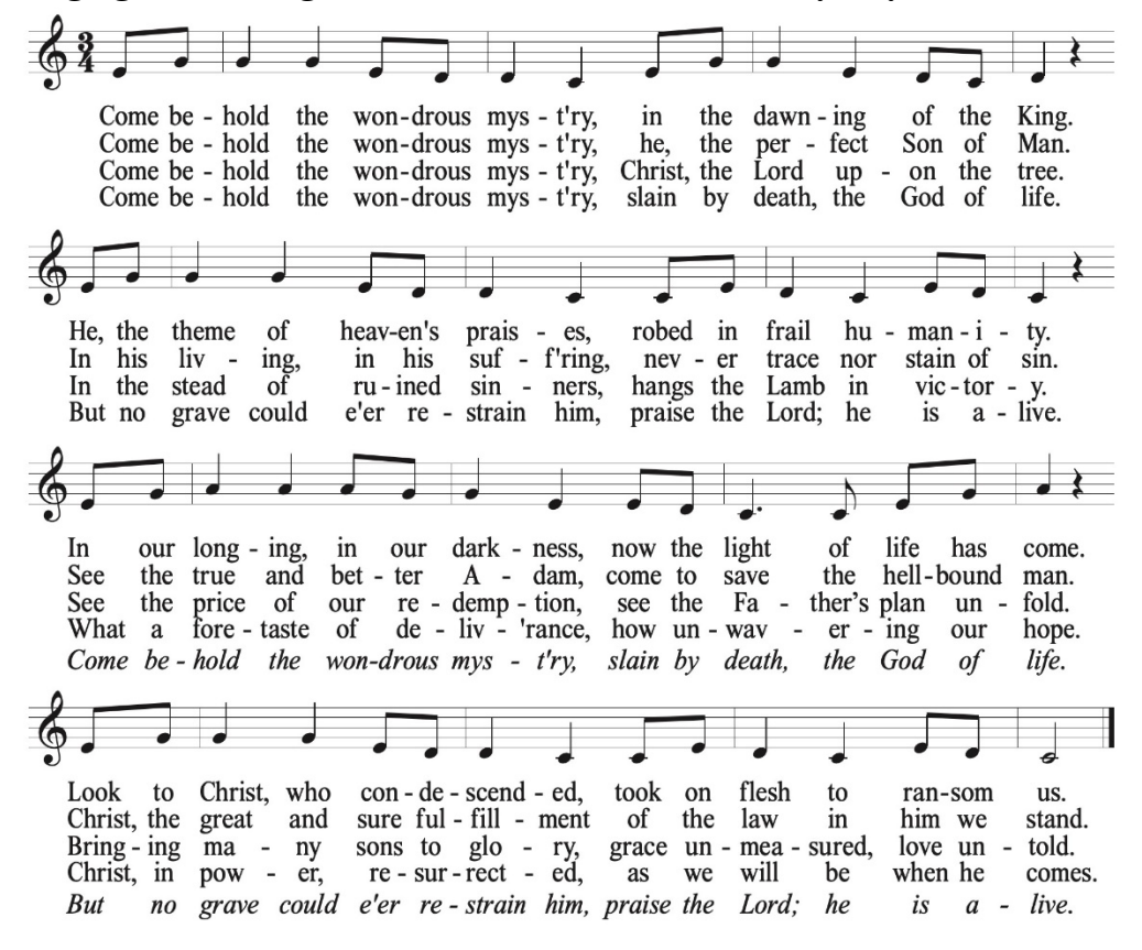
Text and Music: Matt Boswell, Matt Papa, Michael Bleecker ©2013 The Village Church